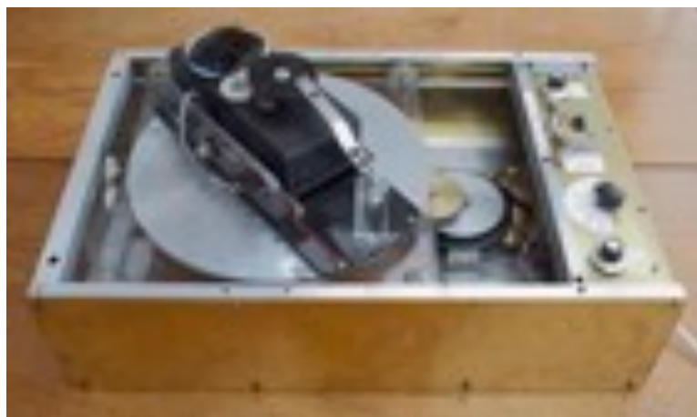
Turntable machine set up to draw with light. Hybrid machine with integral programming but also able to accept instructions from timers.